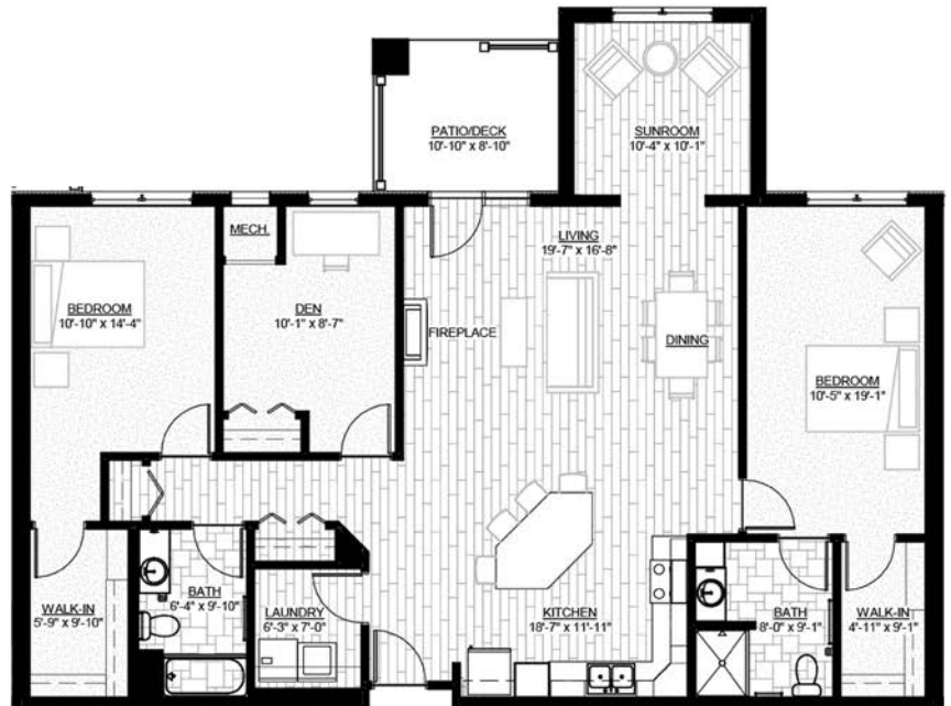
Apartment Style K Two Bedroom/Sunroom/Den 1,701 Sq. Ft.