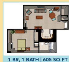
1 BR, 1 BATH | 605 SQ FT