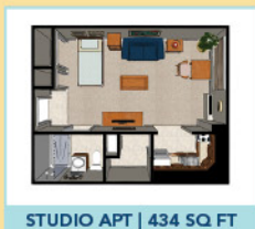
STUDIO APT | 434 SQ FT

One (1) year lease with an automatic renewal clause, unless a thirty (30) day written notice to vacate is received. We collect a security deposit which is equal to one (1) month's rent. Small pets are allowed per the terms of our pet policy and agreement.