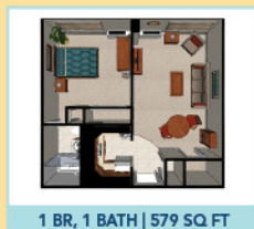
1 BR, 1 BATH | 579 SQ FT